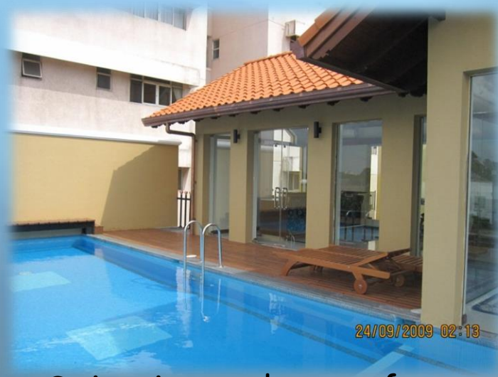
Swimming pool on roof top